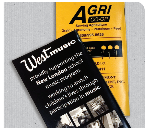
Back Cover Display Advertising