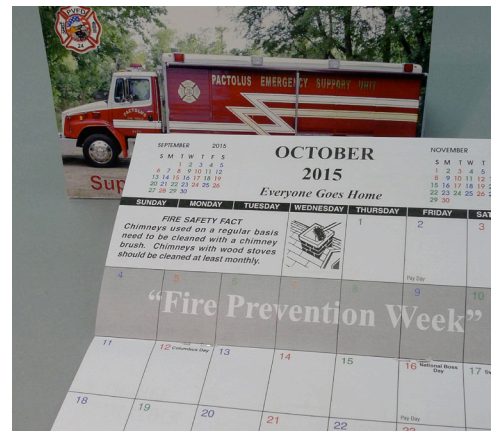
Fire/EMS Shift planner