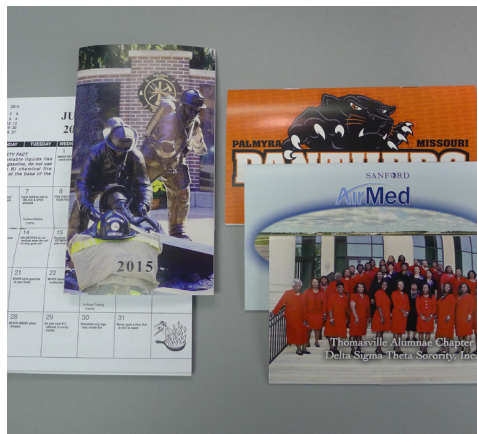
Full Color Photo on Cover