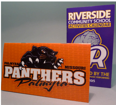
Single Color Cover Using Artwork and Text